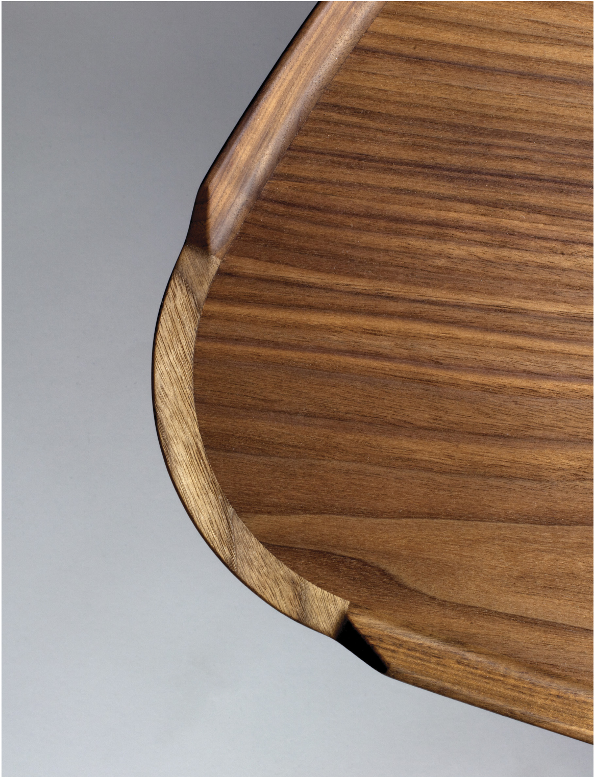
COCKTAIL TABLE 1951 BY FINN JUHL